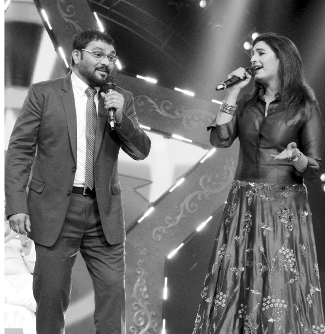
ZINDAGI EK SAFAR: Tribute to the legend of legends, KISHORE KUMAR by Babul Supriyo and Akriti Kakkar

After all no patient likes to be called 'a third class patient'!